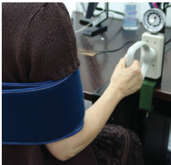
Fig. 1 Measurement of the forearm rotational strength with a light mobile device (baseline wrist dynamometer, Fabrication Enterprises Inc., Elmsford, NY) during clinical visits.

Both LWS and SWV are combined into a single graphical display providing a comprehensive display of osteoarticular wrist clinical status.